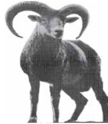
The Ram Medo-Persia 538 - 331 B.C.

“Read the Book of Daniel “The light that Daniel received direct from God was given especially for these last days. The visions he saw by the banks of the Ulai and the Hiddekel, the great rivers of Shinar, are now in process of fulfillment, and all the events foretold will soon come to pass.” The Upward Look - 161 All of Daniel’s visions start when they were given and go to the new earth when the saints possess the kingdom. Babylon had passed when this vision was given